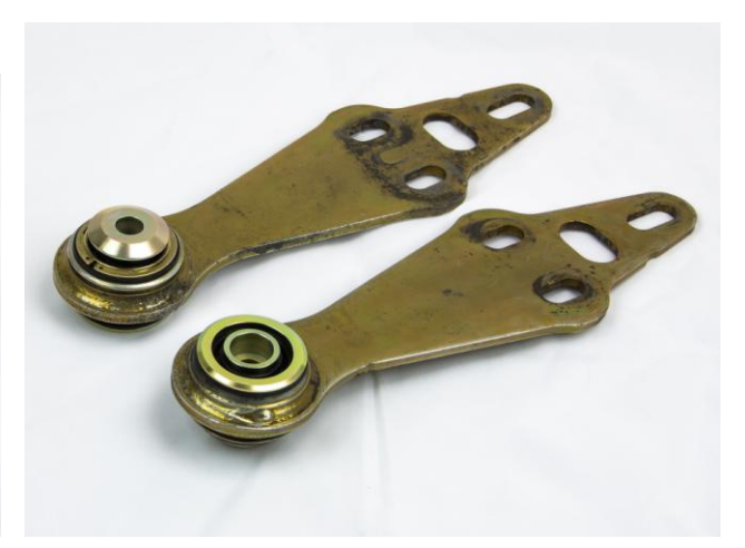
Monoball cartridge installed in original spring plates